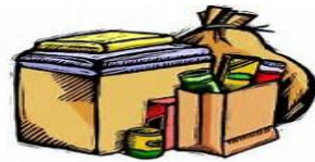
Food Pantry Donations Needed

BINGO & FEAST- Bring A Donation For Feast To Bingo On Monday Night And Get A Free Card To Play, Two Items, Two Free Cards. Limit: Two Free Cards